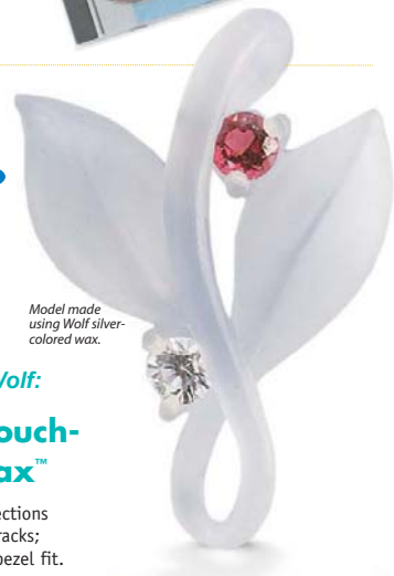
Model made using Wolf silver-colored wax.

Build-up/Repair Wax™ 3 3/4" L x 1 3/16" square bar; 3 oz Gold 700-179 Silver 700-180 $7.95